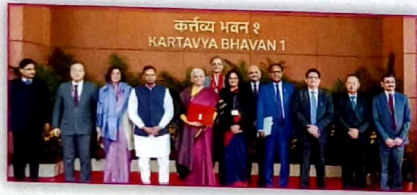
UNION BUDGET 2026

THE JOURNAL FOR GOVERNANCE PROFESSIONALS