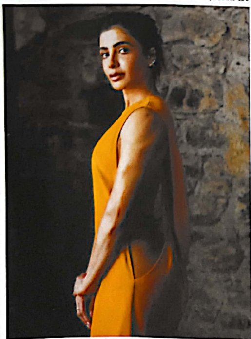
'FLOW STATE', PAGE 156