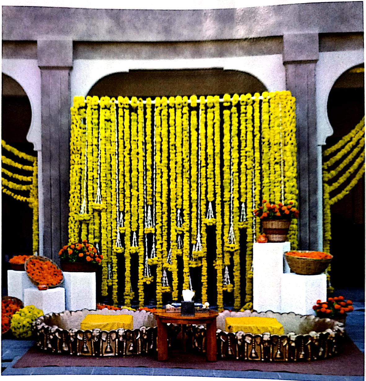
'HOMEWARD BOUND', PAGE 114

142 THE DEBUTANTS Styled by Amanda Harlech.