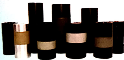
Friction Roller Drum for TFO M/c.'s