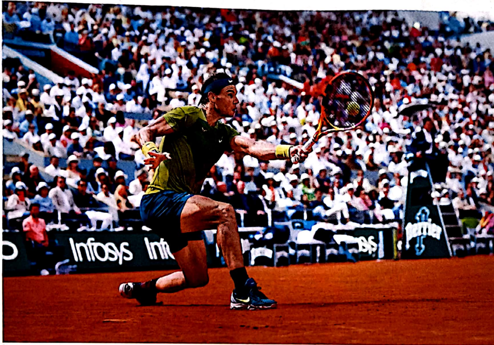
FINAL SHOT: For a tennis fan, attending a Grand Slam is akin to a pilgrimage / 114