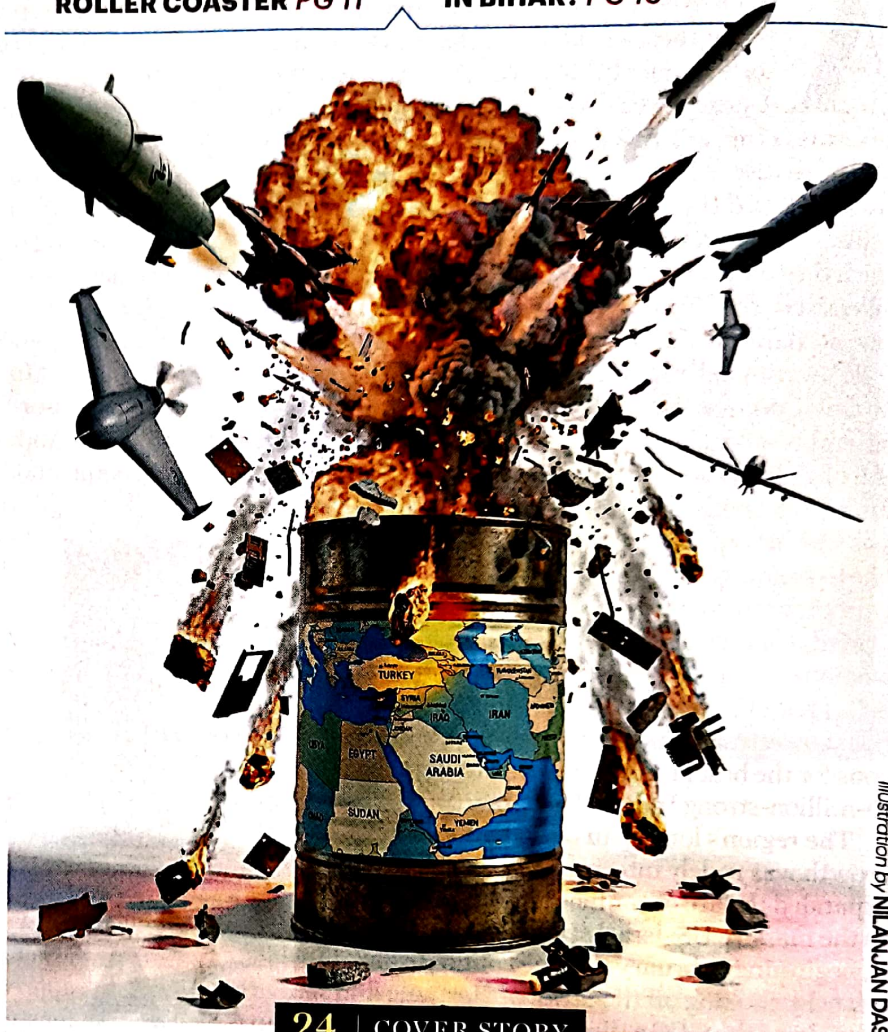
Illustration by NILANJAN DAS