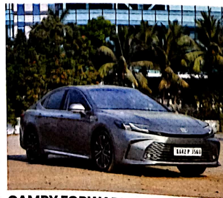
CAMRY FORWARD 70