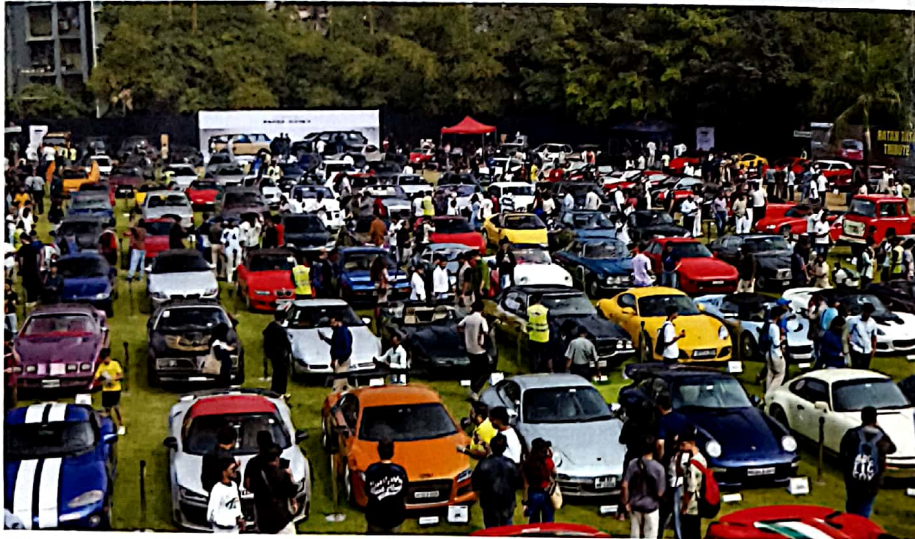
MODERN CLASSIC RALLY 2026: MEET YOUR CHILDHOOD HEROES 88