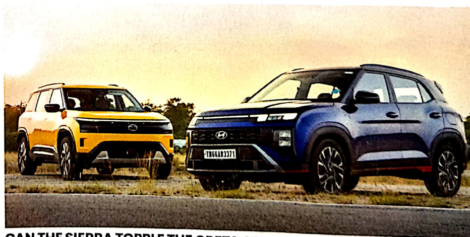
CAN THE SIERRA TOPPLE THE CRETA AS THE MIDSIZE SUV KING? 82