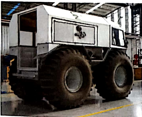
THE MAKING OF A SHERP 104