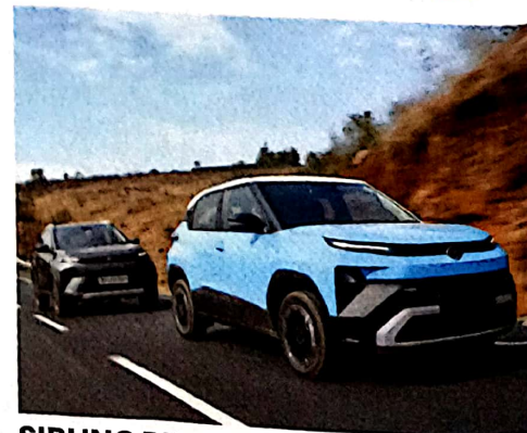
SIBLING RIVALRY 76