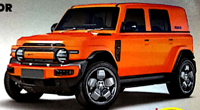
↑... CHERY ICAR V23