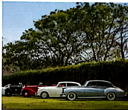
SPIRITS OF ECSTASY 108