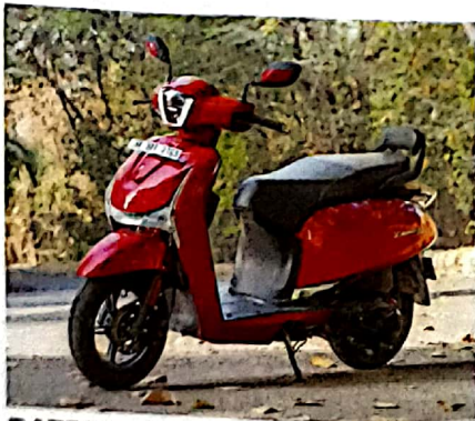
DATE WITH DESTINI 110 140