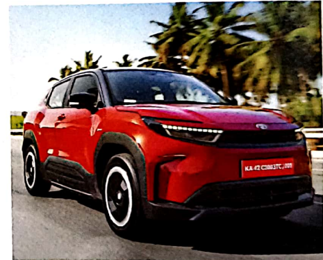
(E) BELLA CIAO 62