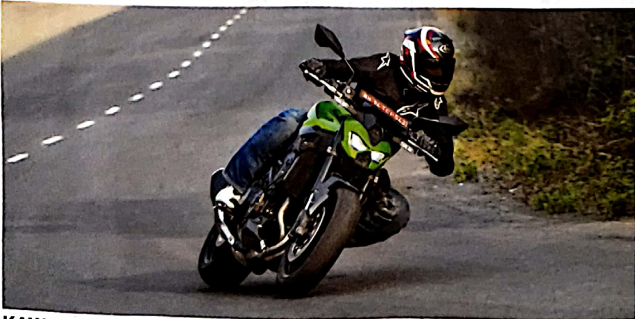
KAWASAKI Z900: UPDATED NAKED IS STILL A PEACH TO RIDE 136