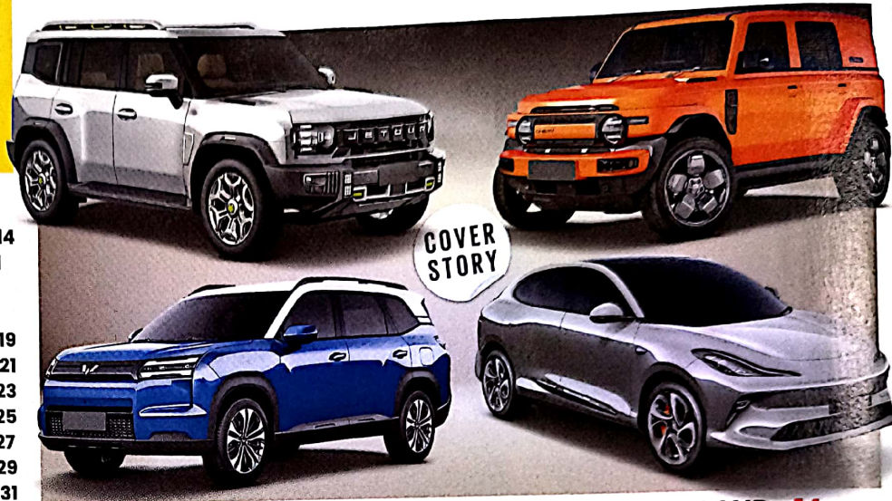
JSW GROUP'S AUTO PLAN: EVS, HYBRIDS AND A NEW BRAND 14

MG Windsor 13,000km report 116 Spacious rear seats ferry a king and a queen