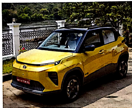
NEW LOOKS, MORE PUNCH 54