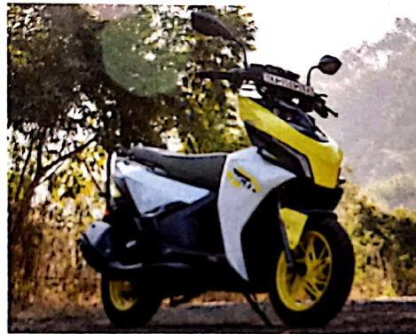
NTORQ 150: FASTEST ONE YET 130