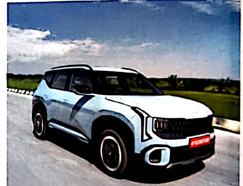
SELTOS: MAKINGS OF A WINNER 40