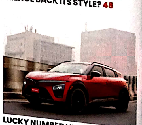
LUCKY NUMBER VF7 68