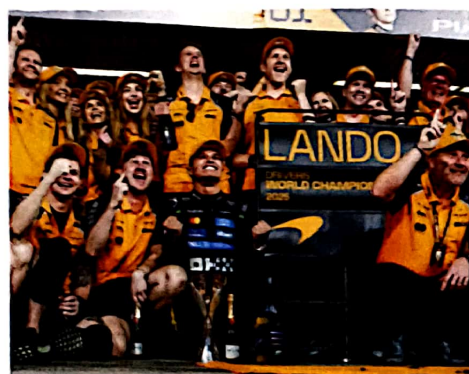
2025 F1: A CLOSE FIGHT 166