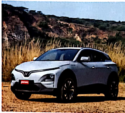
VINFAST VF6 IS VFM 34