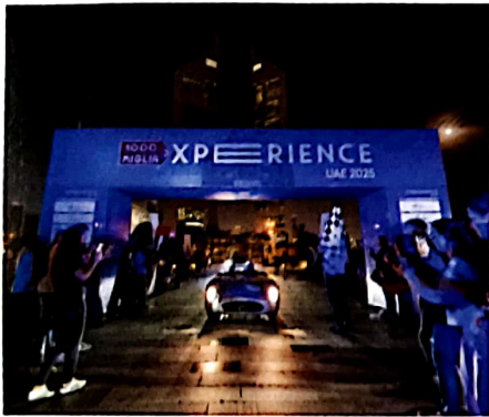
MILLE MIGLIA: UAE EDITION 98