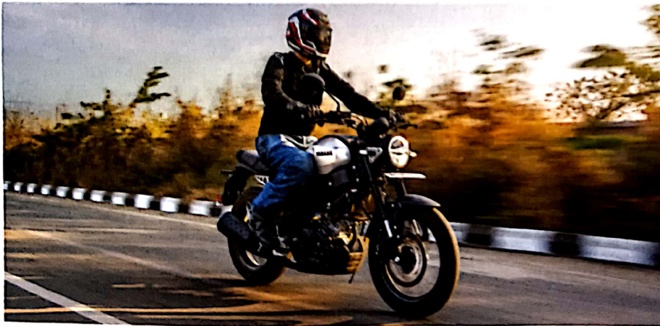
XSR 155: MUCH-AWAITED NEO-RETRO ROADSTER'S HERE 132