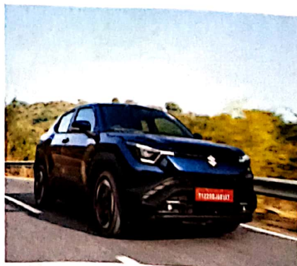
MARUTI'S FIRST EV DRIVEN 60