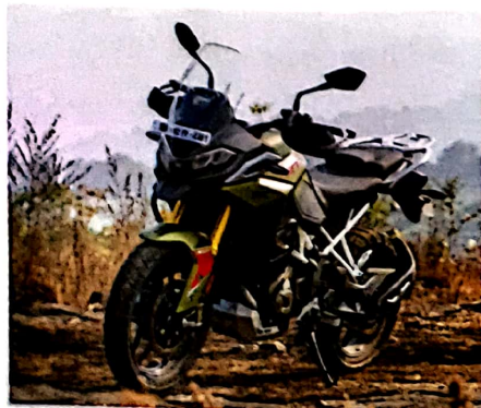
RTX 300 HAS THE X FACTOR 138