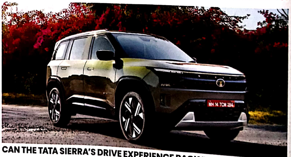
CAN THE TATA SIERRA'S DRIVE EXPERIENCE BACK ITS STYLE? 48