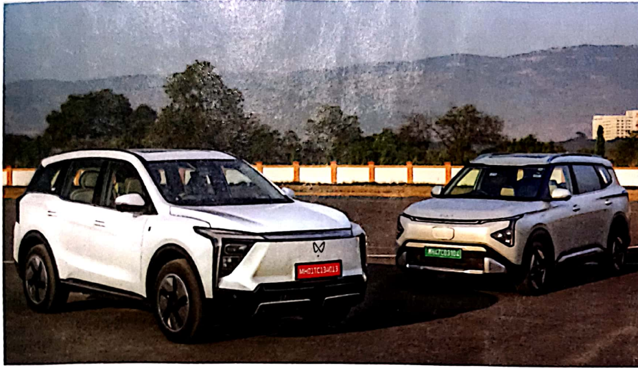
XEV 9S VS CLAVIS EV: WHICH IS THE IDEAL 7-SEAT EV? 80