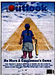
Outlook issue February 11, 2026