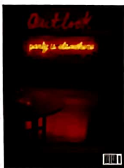
Outlook issue January 21, 2026