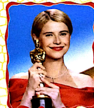
Oscars 2026 : p. 199