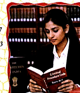
Law Schools Survey 2026 : p. 76