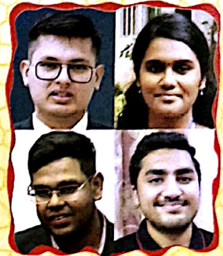
IAS Toppers 2025-26 Secrets Of Success : p. 19