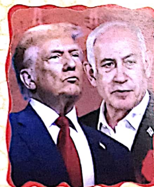
The New War In West Asia : p. 8