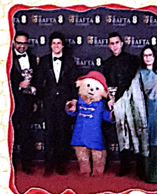
BAFTA Film Awards 2026 : p. 201

DIRECTORY OF HOTEL MANAGEMENT INSTITUTES