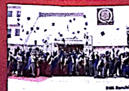
Directory Of Hotel Management Institutes : p. 91

DIRECTORY OF HOTEL MANAGEMENT INSTITUTES