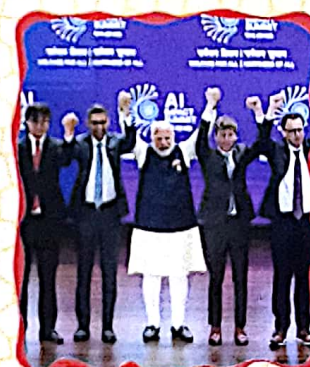
The India AI Impact Summit 2026 : p. 13