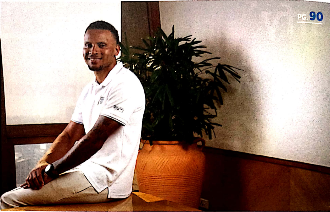
Canadian sprinter and twice Olympic champion Andre de Grasse was the international brand ambassador at the Tata Mumbai Marathon

As AI automates cognitive tasks, India's white-collar workforce faces slower hiring, higher expectations, and a growing need for deep AI capability