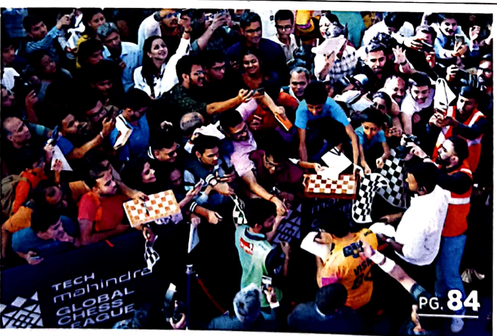
Fans gather for autographs from Viswanathan Anand and D Gukesh at the Tech Mahindra Global Chess League in Mumbai