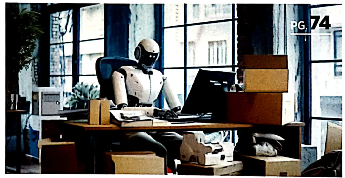
World Economic Forum takes a note of AI-led workforce reductions