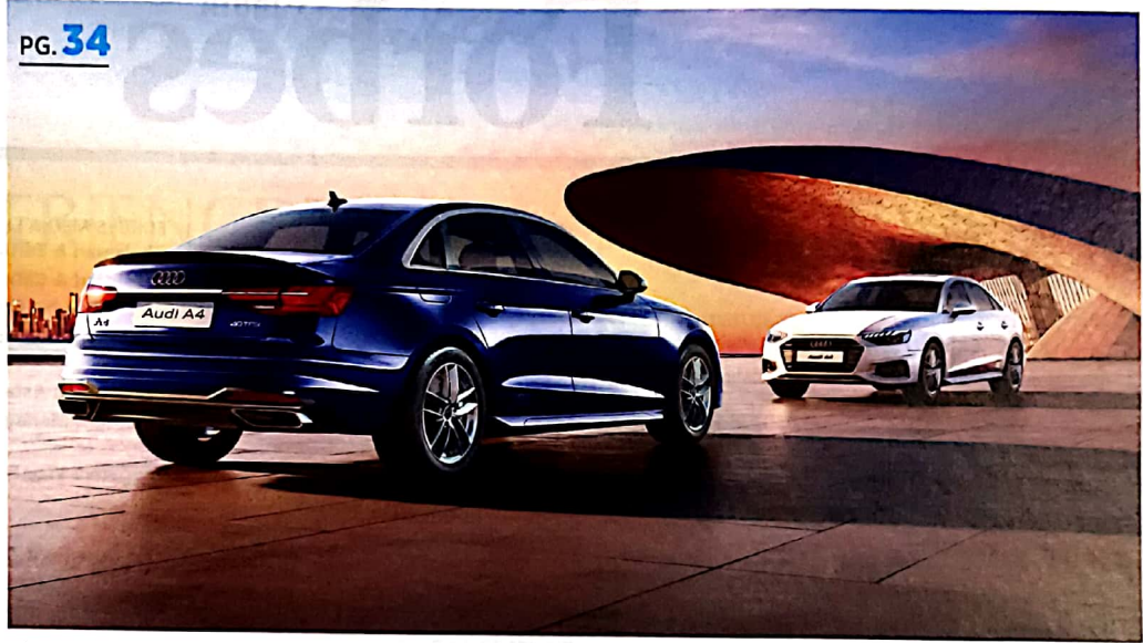
The Audi A4 Signature Edition. For the company, true luxury is about making ownership more personal