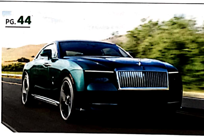
The Rolls-Royce Spectre starts at around ₹7.6 crore