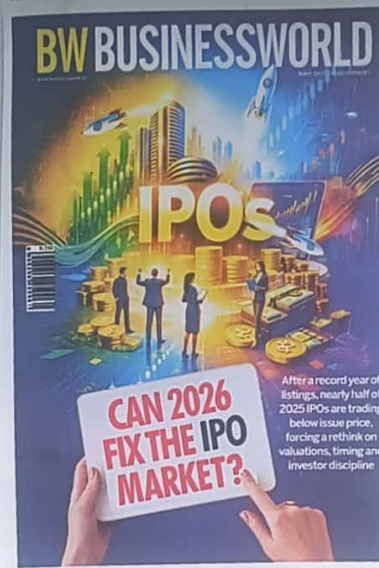
After a record year of listings, nearly half of 2025 IPOs are trading below issue price, forcing a rethink on valuations, timing and investor discipline