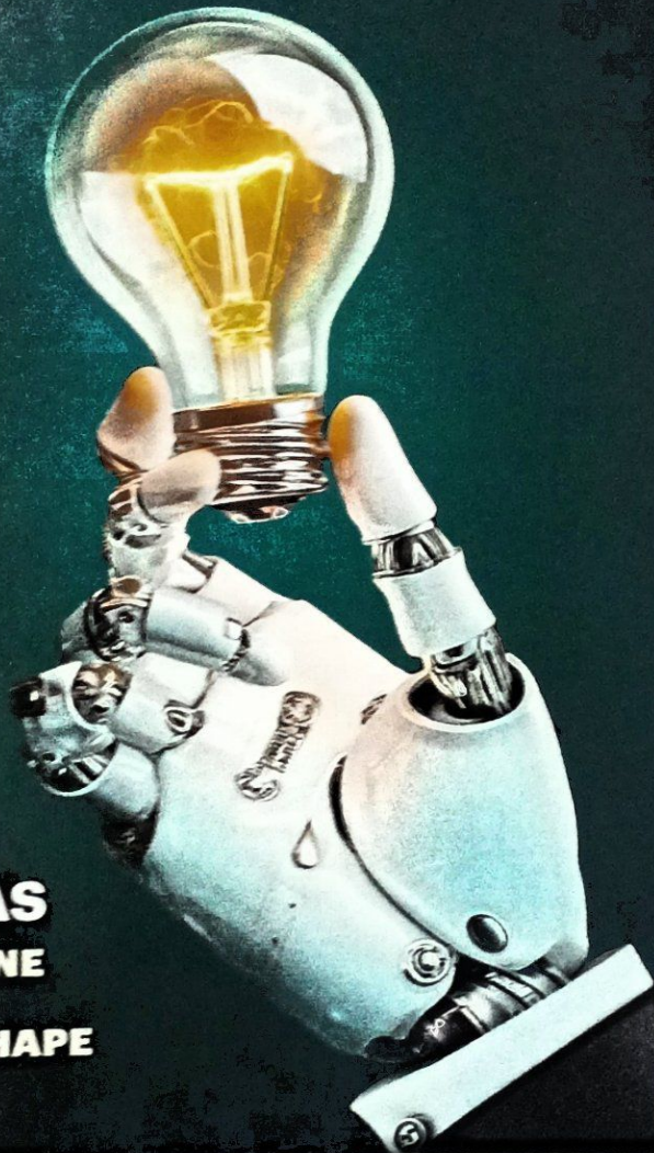
ILLUSTRATION BY NILANJAN DAS

THE BIG IDEAS REFORMS TO DEFINE THE NEXT TWO DECADES—AND SHAPE INDIA'S CENTURY