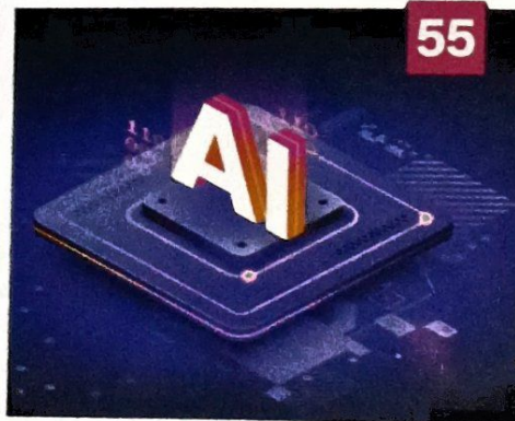
Open Source Tools: Helping to Build AI-Powered Edge Intelligence