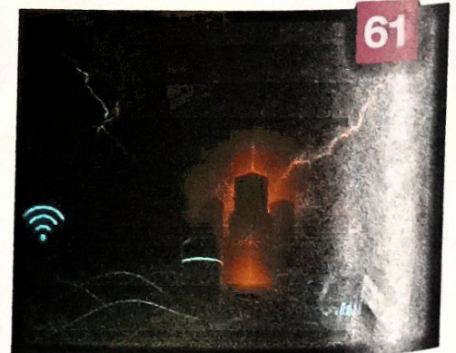
The Fragile Edge: Chaos Engineering for Reliable IoT