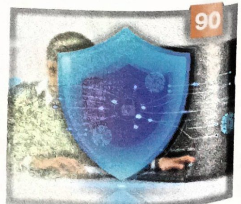
Warning! Engineered Linux Malware can Bypass Next-Gen Anti-Virus Solutions