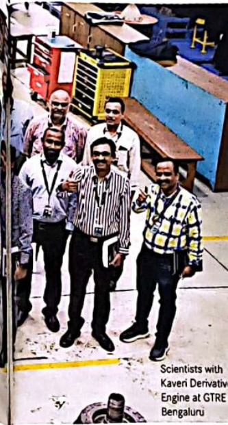
Scientists with Kaveri Derivative Engine at GTRE in Bengaluru