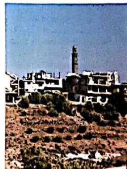
ANAGHA SUBHASH INAR