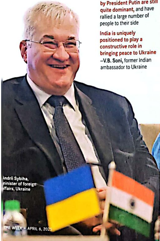
Andrii Sybiha, minister for foreign affairs, Ukraine

India is uniquely positioned to play a constructive role in bringing peace to Ukraine —V.B. Soni, former Indian ambassador to Ukraine