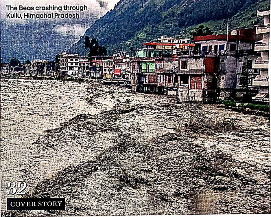
The Beas crashing through Kullu, Himachal Pradesh

STATESCAN: EPS & HIS COALITION OF THE UNWILLING PG 20