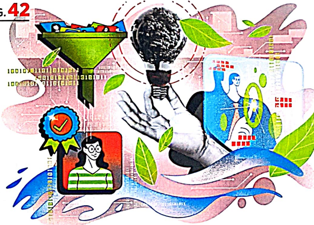
Family enterprises contribute over 70 percent of global GDP