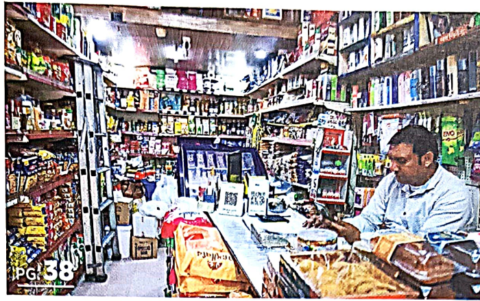
Grocery stores, such as this one in Dwarka, New Delhi, are experiencing lower purchase volumes amid the rise of QComm