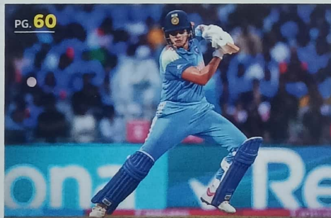
Shafali Verma during her knock of 87 in the World Cup final against South Africa