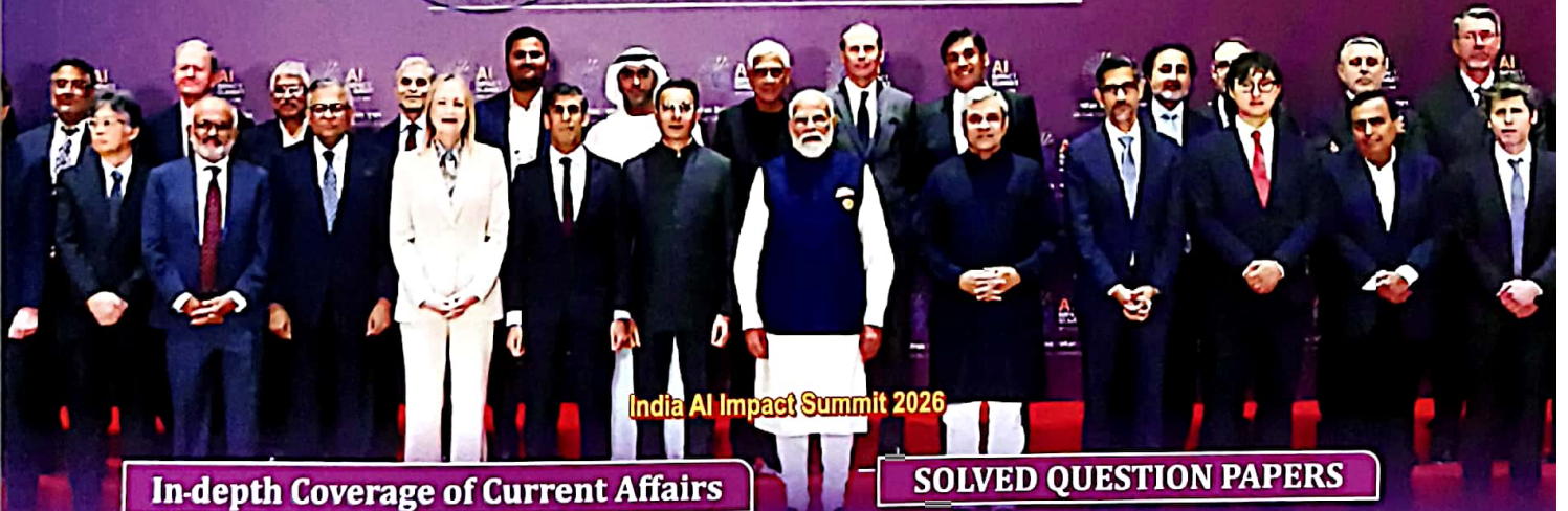
India AI Impact Summit 2026