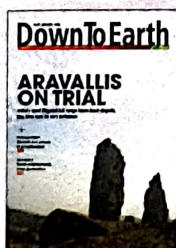
◀ Cover design: Ajit Bajaj

To subscribe, sms 'dte Subscribe' to 56070 or visit www.downtoearth.org.in/subscription FOR ADVERTISEMENTS Jyoti Ghosh jghosh@cseindia.org FOR SUBSCRIPTIONS K C R Raja, raja@cseindia.org