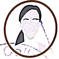
YOU CAN BE NEXT