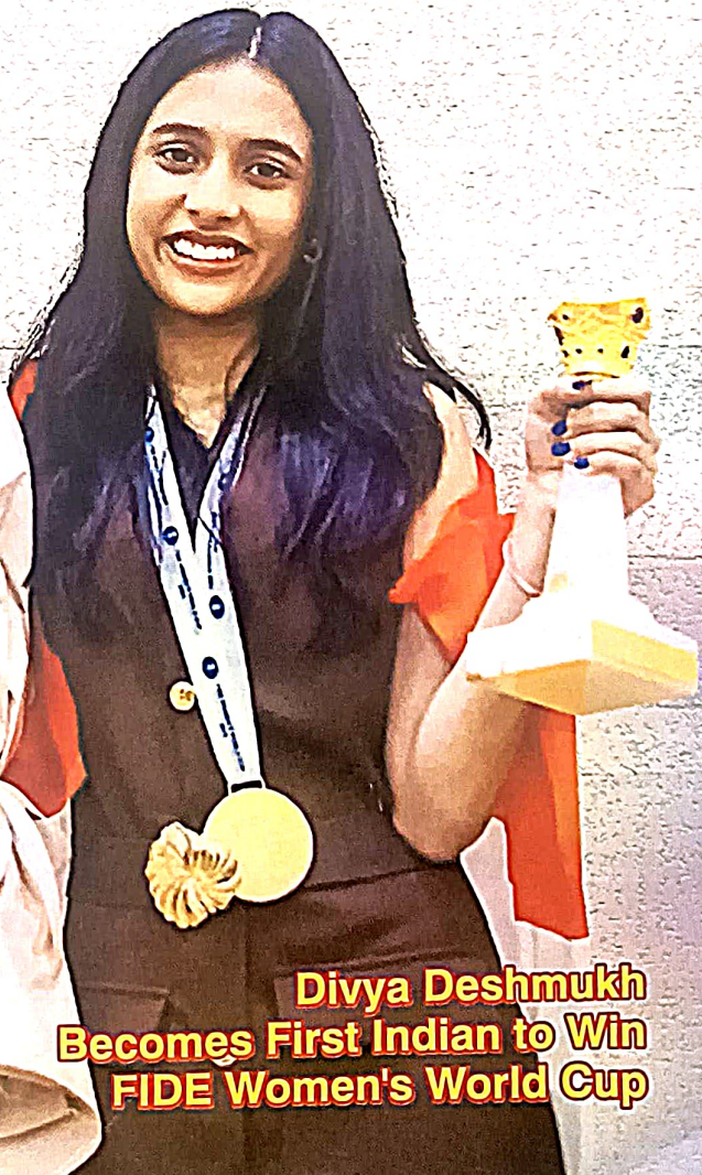
Divya Deshmukh Becomes First Indian to Win FIDE Women's World Cup