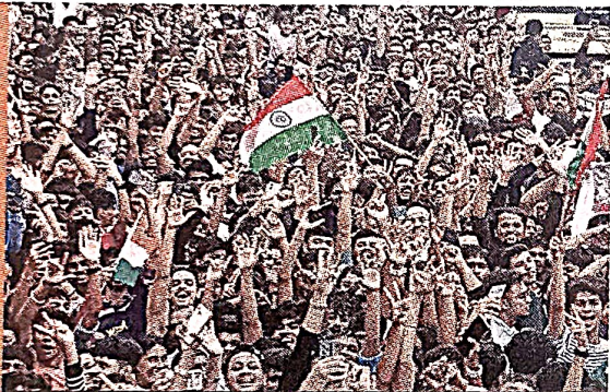
India's Population Reaches 146.39 crore