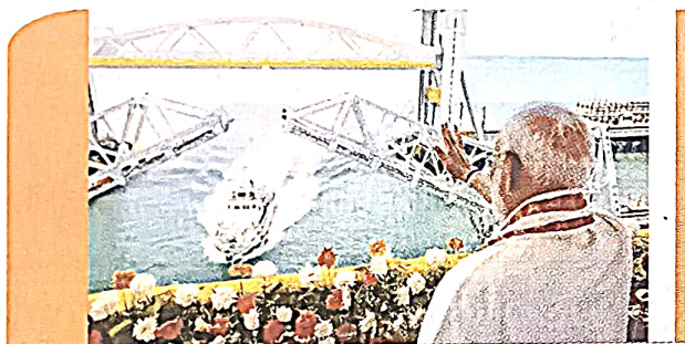
Prime Minister Narendra Modi inaugurates the Pamban rail bridge