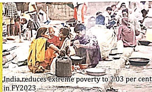
India reduces extreme poverty to 2.03 per cent in FY2023

57 Environment, Ecology, Biodiversity and Climate Change