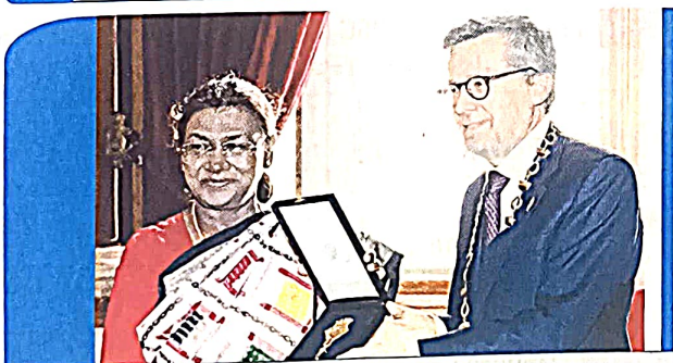
Mayor of Lisbon Carlos Moedas hands over the 'Key of Lisbon' to President Droupadi Murmu, in Lisbon