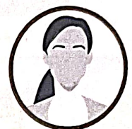
YOU CAN BE NEXT