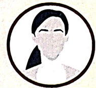
YOU CAN BE NEXT