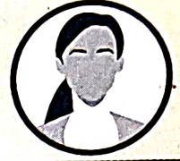
YOU CAN BE NEXT