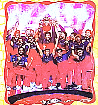
RCB Wins IPL 2025 Trophy : p. 208