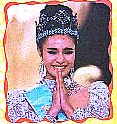
Miss World 2025 : p. 209