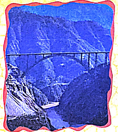
Chenab Rail Bridge : p. 10