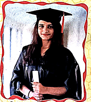
Law Schools Survey 2025 : p. 71