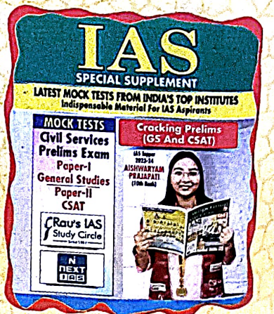
Latest Mock Tests From India's Top Institutes : p. 81