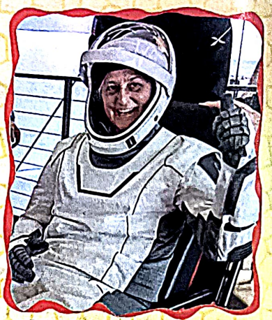
Ms. Sunita Williams's 286 Days In Space : p. 18