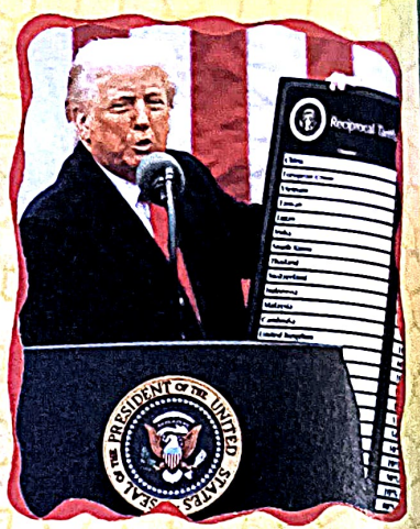
Trump's Tariff War : p. 11