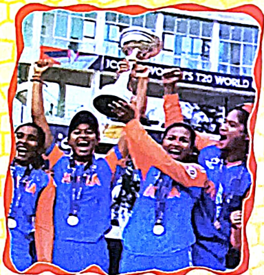
ICC Women's Under-19 T20 World Cup : p. 207