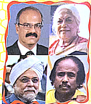
Padma Awards 2025 : p. 8