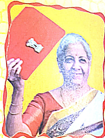
FM Ms. Nirmala Sitharaman Union Budget 2025-26 : p. 11

Padma Awards 2025 ...8 Indian National Movement ...57 BBC : Mastermind India ...82 Constitution Of India ...161 Forthcoming Exams ...201 Word Power ...202 Improve Your Personality ...203 Grammy Awards 2025 ...209