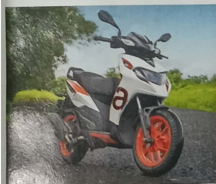
OLD WINE IN NEW BOTTLE? 142