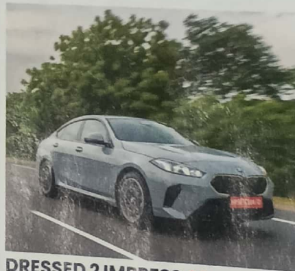
DRESSED 2 IMPRESS 40