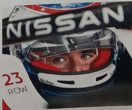
CROWNING GLORY 164