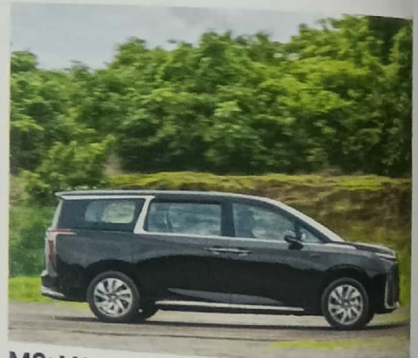
M9: VAN WITH A PLAN 56