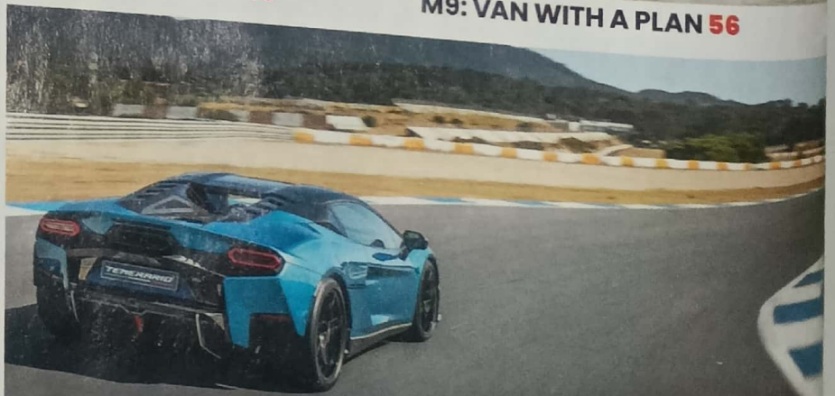
10,000RPM TWIN-TURBO V8: MEET LAMBO'S NEW RAGING BULL 88