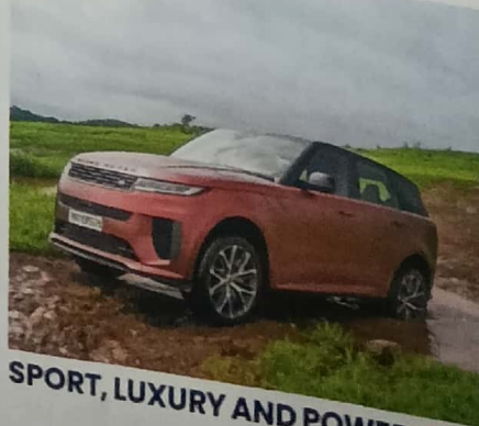
SPORT, LUXURY AND POWER 64