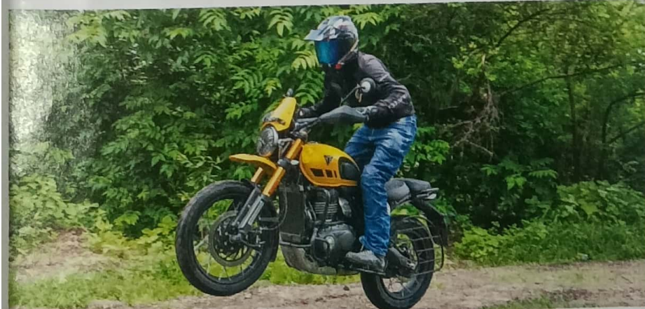
SCRAMBLER 400 XC: MORE FEATURES FOR NOT MUCH MORE 148