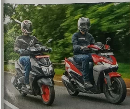
XOOM-ING AHEAD? 154