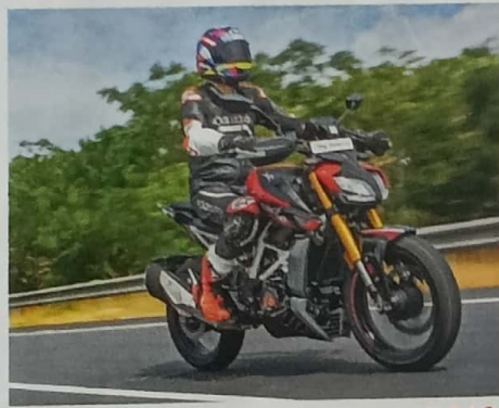
UPGRADED BUT COSTS LOWER 146