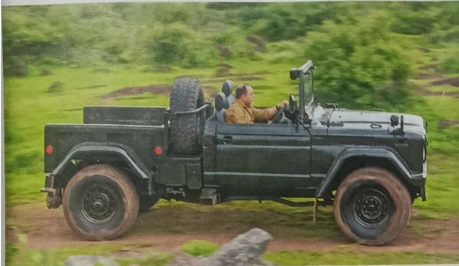
KIA'S REAL BADASS YOU CAN'T BUY 108