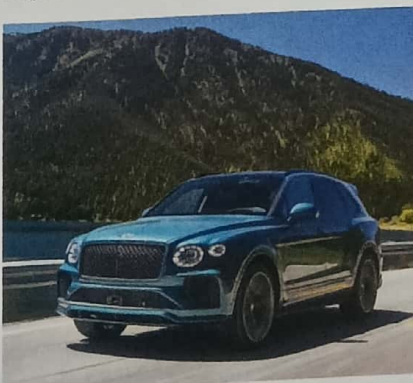
BENTAYGA SPEED THRILLS 54