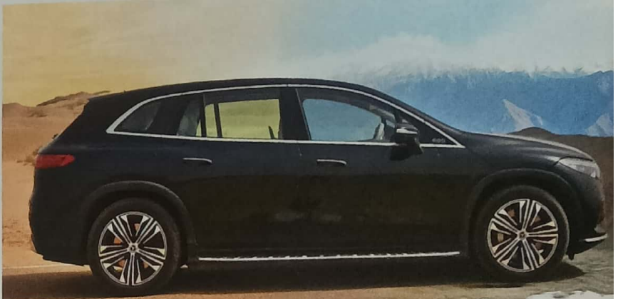
EQS SUV ROAD TRIP CAPTURING INDIA'S CLIMATIC EXTREMES 80