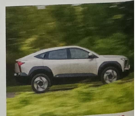
XEV 9e: THE FULL ROAD TEST 58