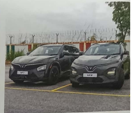
FROM VIETNAM, WITH LOVE 38