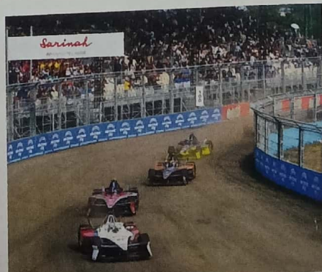
MAHINDRA P2 IN JAKARTA 148

Hyundai Ioniq 5 Final report 104 Farewell to our favourite EV Mercedes-Benz EQS SUV Final report 106 Mumbai-Surat-Mumbai in one charge?