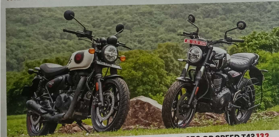
THE RS 2 LAKH QUESTION: UPDATED HUNTER 350 OR SPEED T4? 132