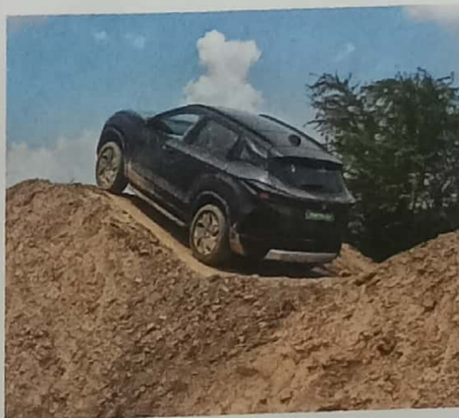
HARRIER EV IN THE WILD 34