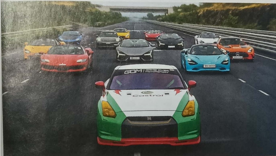
THE 300KPH CLUB – SUPERCARS GO ALL-OUT AT NATRAX 90