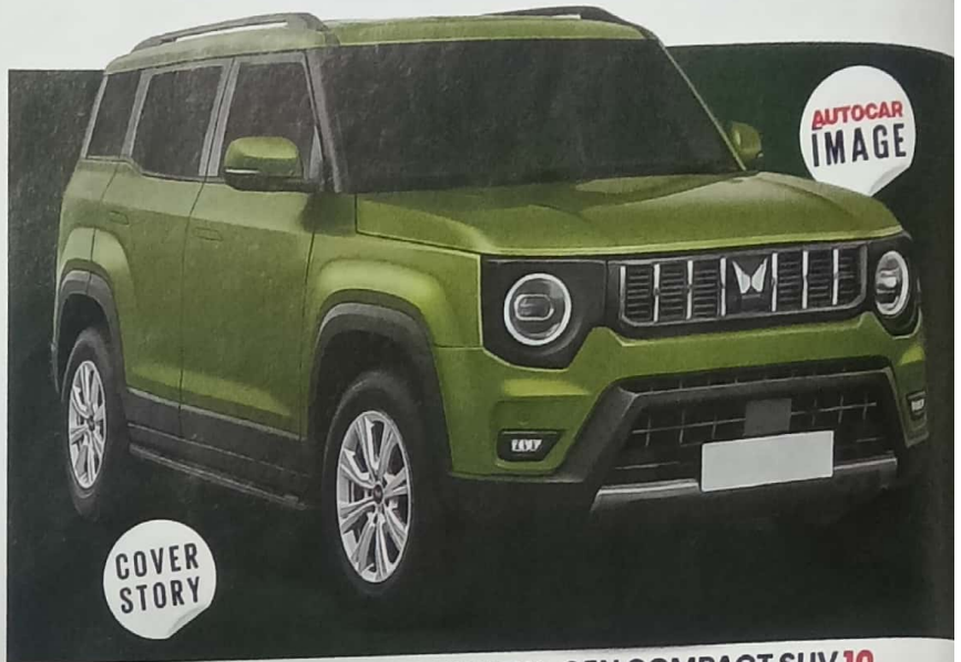
KEY DETAILS ABOUT MAHINDRA'S NEW-GEN COMPACT SUV 10