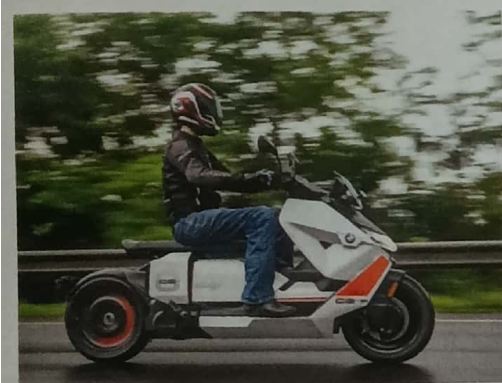
THE RS 15 LAKH SCOOTER 120