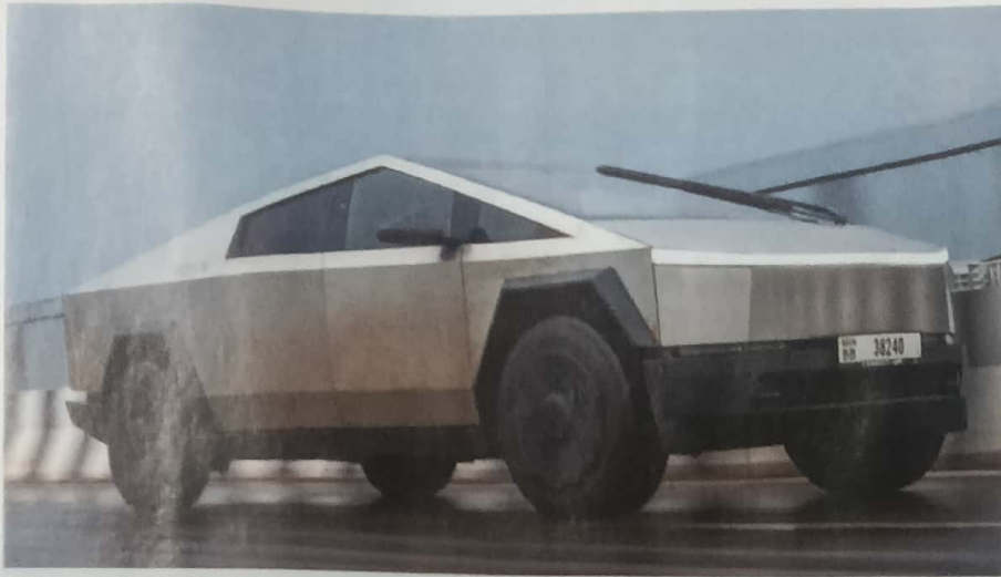
OUTRAGEOUS TESLA CYBERTRUCK BELONGS TO THE FUTURE 62