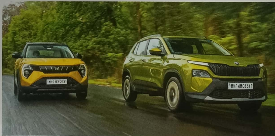
CAN THE EXCITING SKODA KYLAQ OUTDO MAHINDRA'S XUV 3XO? 82