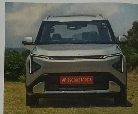
CARENS GOES UPMARKET 38