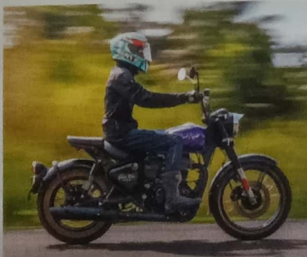
GO, GOAN CLASSIC, GONE 158