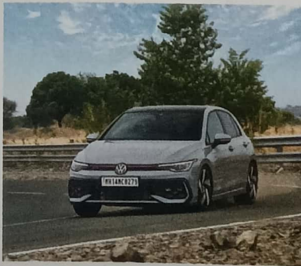
GOLF GTI: LEGEND HAS IT... 56