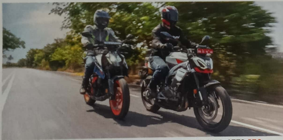
CAN THE 390 DUKE HOLD ITS OWN AGAINST A TUONO 457? 152