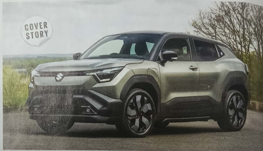
E VITARA DRIVEN: THE START OF SUZUKI (AND MARUTI'S) EV AGE 72

Samruddhi Mahamarg's new tunnel 90 Game-changing tunnel driven in mad AMG S63 Sales analysis 96 The winners and losers of the year gone by Range Rover Sport vs Porsche Cayenne 106 Very different ways of spending big on an SUV BMW Drift Academy 112 A rookie learns how to slip and slide like a pro Mega AC test 114 How effective is your midsize SUV's AC? Porsche track experience 118 Mirror mirror on the wall, I want to drive 'em all