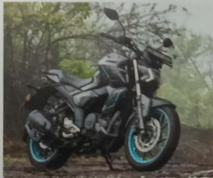
SAY 'HY' TO FI YAMAHA 140