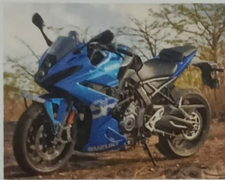
SEE YOU 8R 142