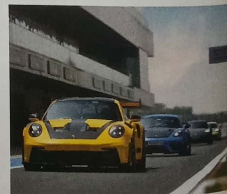
PORSCHE UNLEASHED AT BIG 118