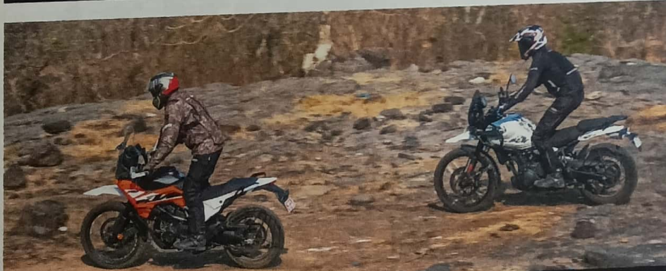
NEW KTM 390 ADVENTURE TAKES ON RE HIMALAYAN 450 168