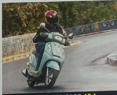
ALL ACCESS PASS 164