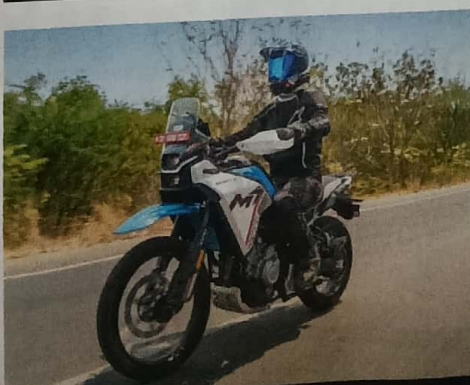
NEW CFMOTO ADV TEMPTS 160