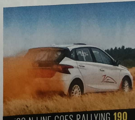
i20 N LINE GOES RALLYING 190