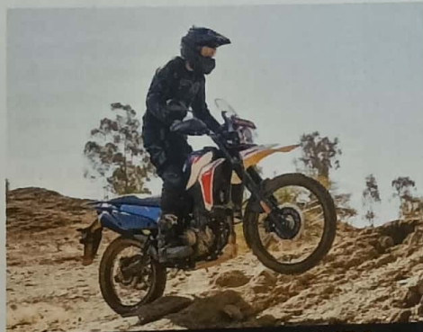
XPULSE OF THE NATION 154