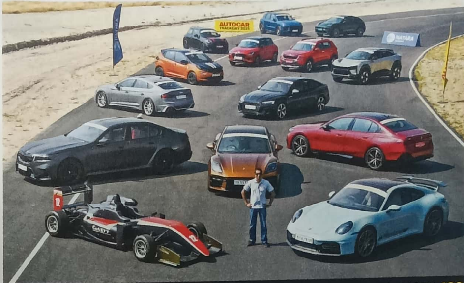
NARAIN GOES ALL OUT IN EVERYTHING FROM A HATCH TO AN F3 RACER 102