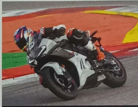
NEW CFMOTOS RIDDEN 154