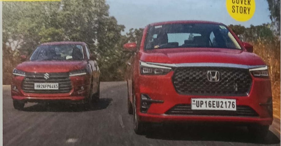
NEW DZIRE AND AMAZE FIGHT FOR COMPACT SEDAN CROWN 84