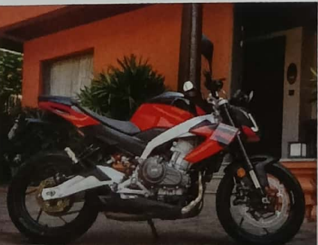
TUONO 457: FRIENDLY THUNDER 150