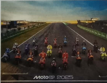
2025 F1, MOTOGP GUIDE 174