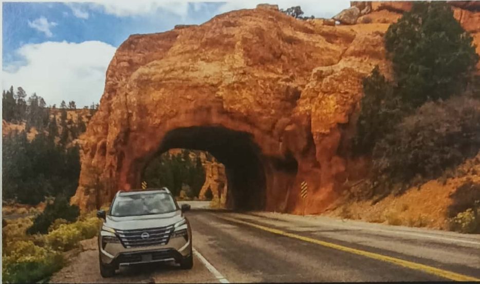
AN ADVENTURE THROUGH UTAH'S BADLANDS 96