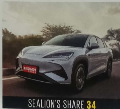
SEALION'S SHARE 34