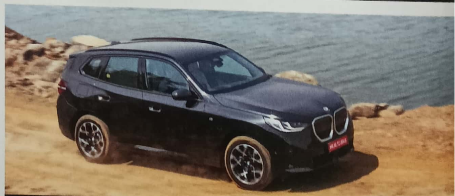
NEW BMW X3: TAKE A CHILL PILL 40