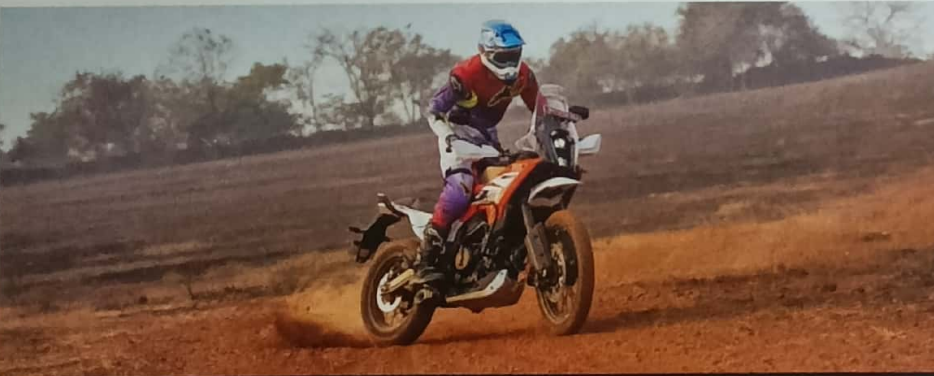
NEW KTM 390 ADVENTURE: SO, SO TEMPTING 144