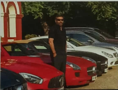
COLLECTOR'S ADDITION 104