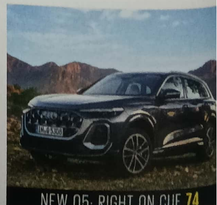
NEW Q5: RIGHT ON CUE 74