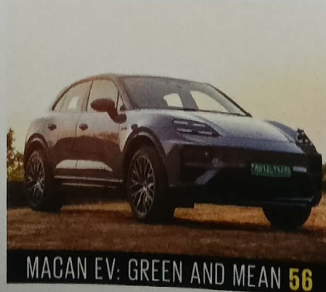
MACAN EV: GREEN AND MEAN 56