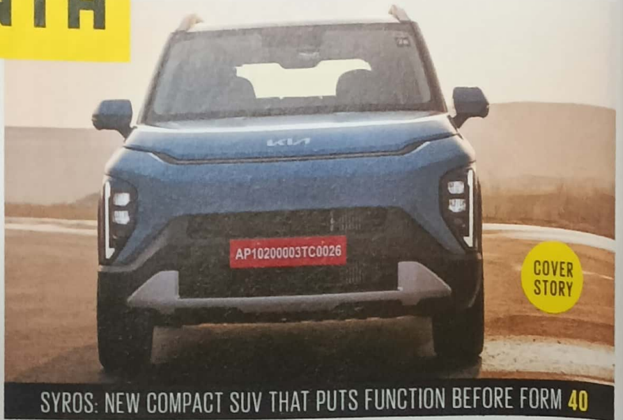
SYROS: NEW COMPACT SUV THAT PUTS FUNCTION BEFORE FORM 40