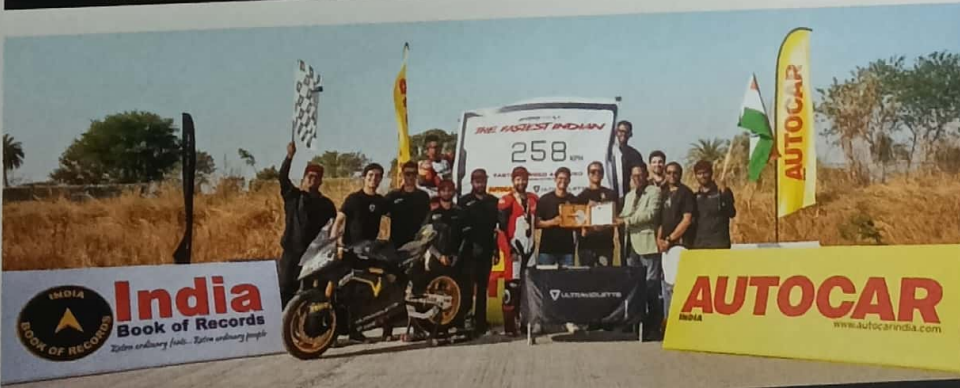
SMASHING THE SPEED RECORD FOR AN INDIAN MOTORCYCLE! 160