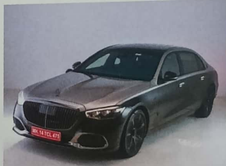
V12 IS THE ULTIMATE LUXURY 60