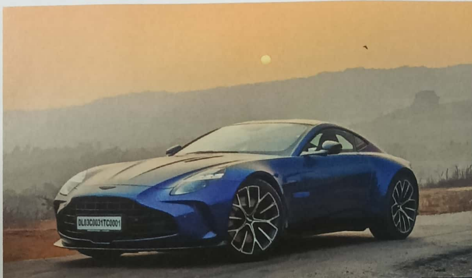
SHAKEN, NOT STIRRED: BOND'S 665HP DAILY DRIVER IS HERE 62