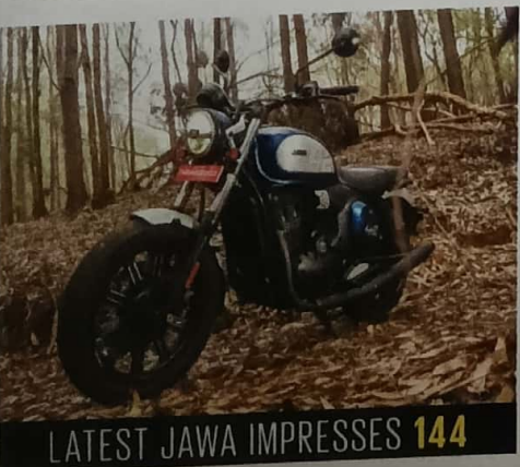
LATEST JAWA IMPRESSES 144