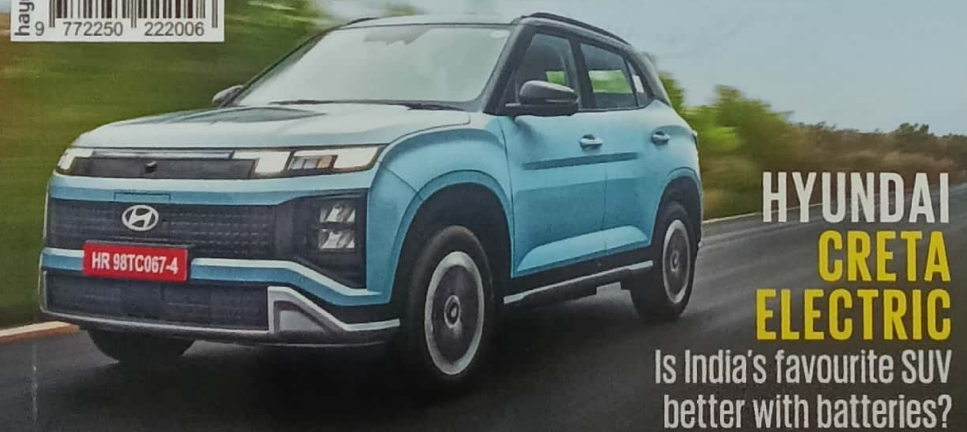
HYUNDAI CRETA ELECTRIC Is India's favourite SUV better with batteries?