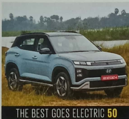
THE BEST GOES ELECTRIC 50