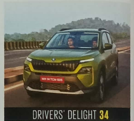
DRIVERS' DELIGHT 34