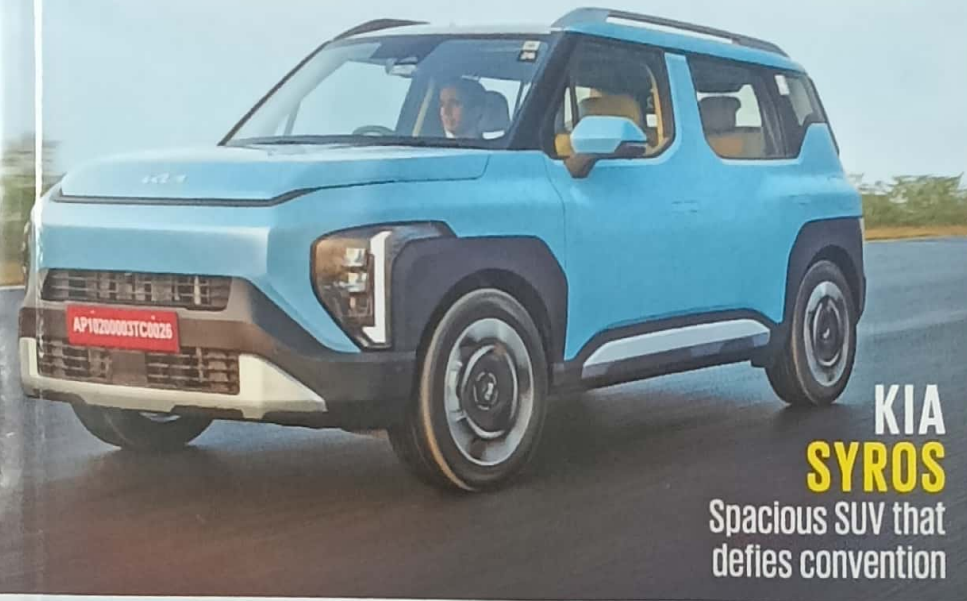
KIA SYROS Spacious SUV that defies convention