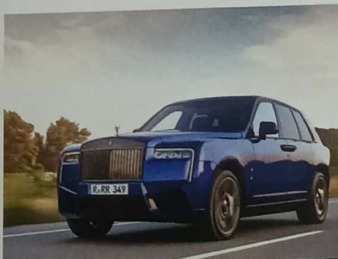
HIGH AND MIGHTY 80