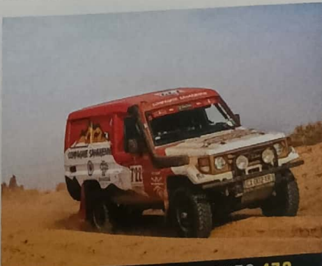
DAKAR 2025 HIGHLIGHTS 172

Hyundai Ioniq 5 21,000KM REPORT 129 Our 2024 Car of the Year proves its mettle Audi Q3 Sportback FINAL REPORT 130 Compact luxury SUV bids adieu; it will be missed