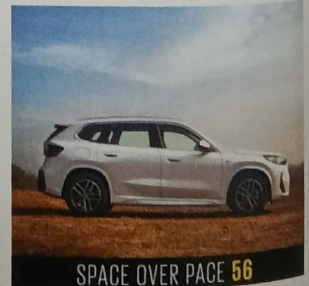
SPACE OVER PAGE 56