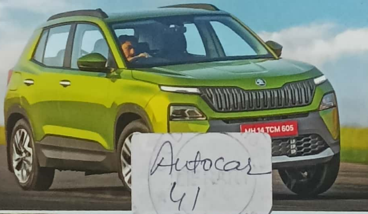
SKODA KYLAQ Solid and fun-to-drive compact SUV