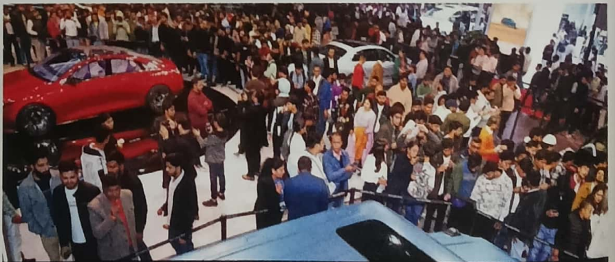
FULL REPORT ON ALL IMPORTANT CARS AT THE AUTO EXPO 2025 102