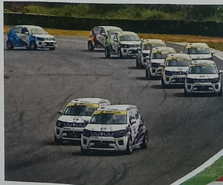
INTO THE FAST LANE 154