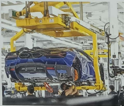
THE BULL'S BIRTHPLACE 72