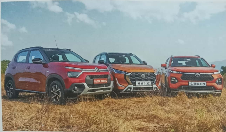
C3 X VS MAGNITE VS TAIOR: TURBO-AUTO SUVs FIGHT IT OUT 54