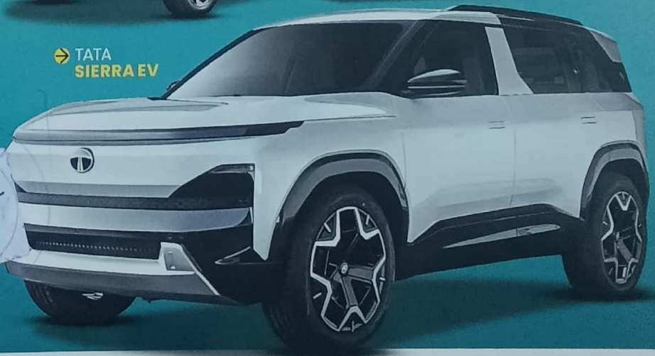
TATA SIERRA EV