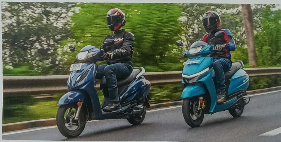
ACTIVA VS JUPITER: INDIA'S TOP TWO SELLERS COMPARED 134