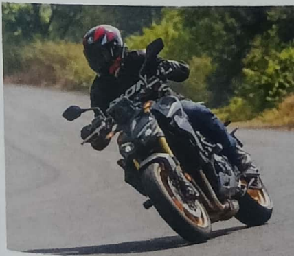
HORNET 1000: WAKE UP CALL 130