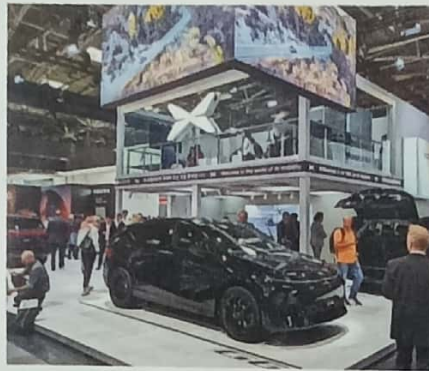
SHOWSTOPPERS FROM IAA 30