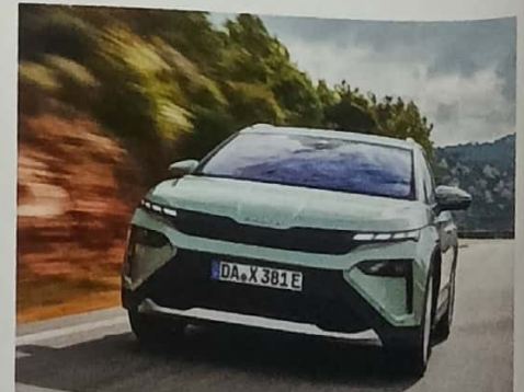
ELROQ: SKODA'S IONIQ 5 RIVAL 54