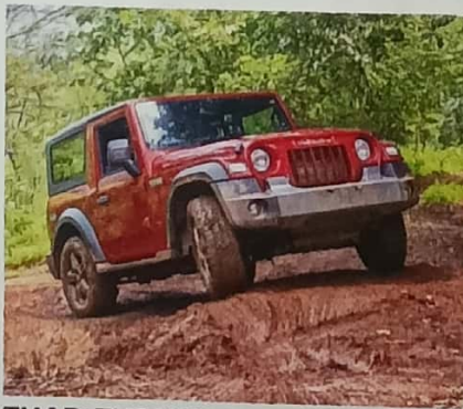
THAR: THE LITTLE THINGS 50