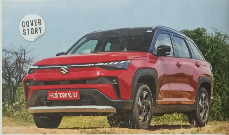
V FOR VICTORIS: NEW MARUTI SUV IS GUNNING FOR THE CRETA 38