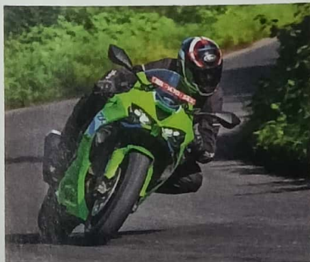
ZX-6R: PRIMAL SCREAM 114