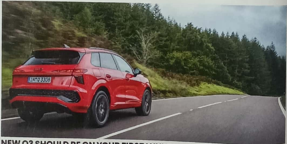
NEW Q3 SHOULD BE ON YOUR FIRST LUXURY CAR SHORTLIST 58