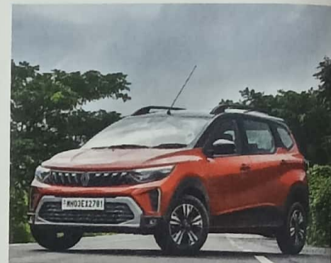
7 UP: UPDATED TRIBER 36