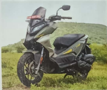
XOOM-ING IN 102