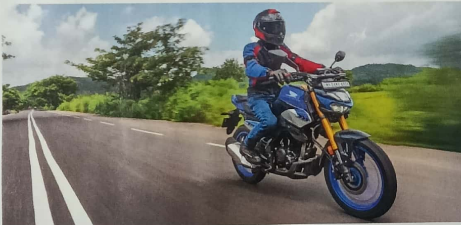
CB125 HORNET AIMS FOR SPORTY COMMUTER DOMINANCE 122