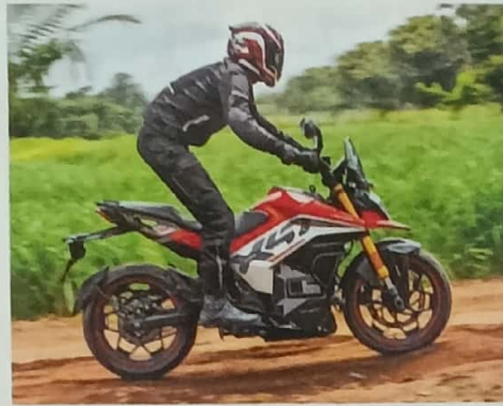
X47: UV'S COMFY E BIKE 110