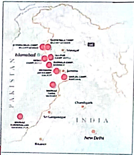
Nine Targets prioritised as per the existing presence of terrorist