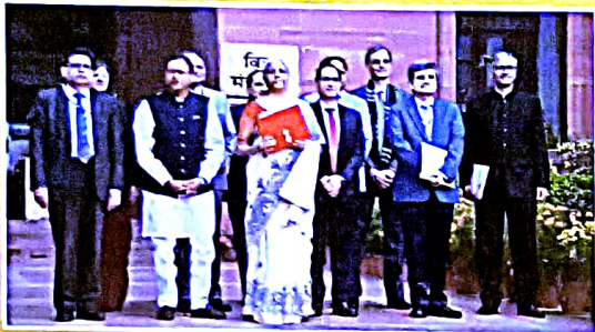
UNION BUDGET 2025

THE JOURNAL FOR GOVERNANCE PROFESSIONALS